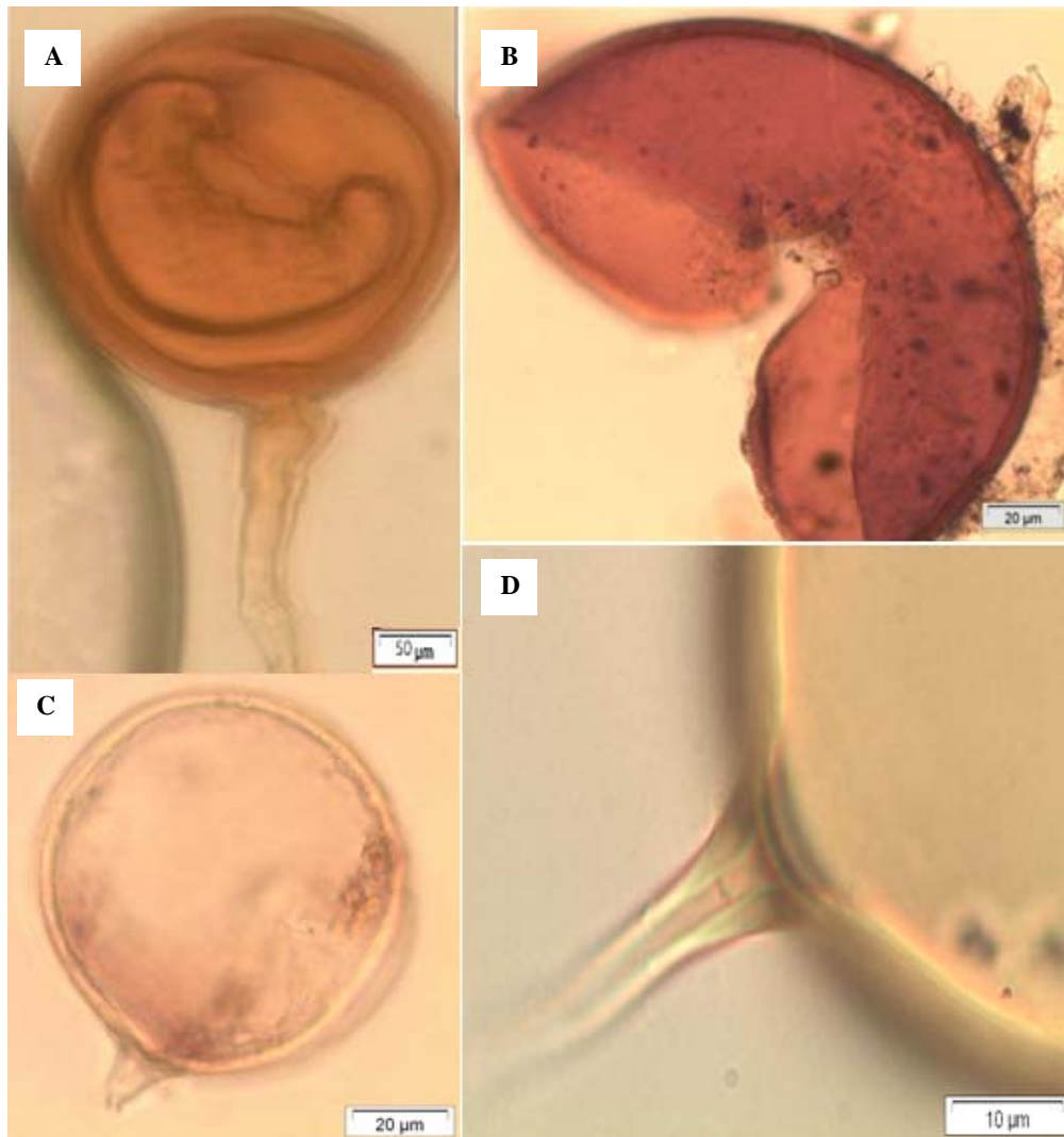
Fig. 1- Mature spores of Funneliformis geosporum (A), Glomus constrictum (B), Funneliformis mosseae (C) and Rhizophagus clarus (D).